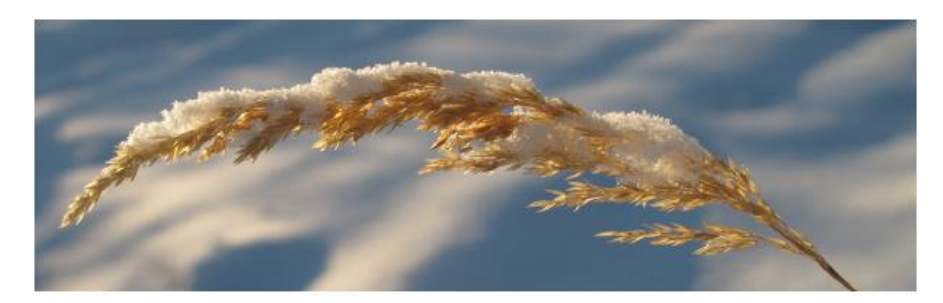
SLT Report January 2017